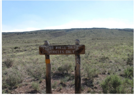
11-8 Warning Sign