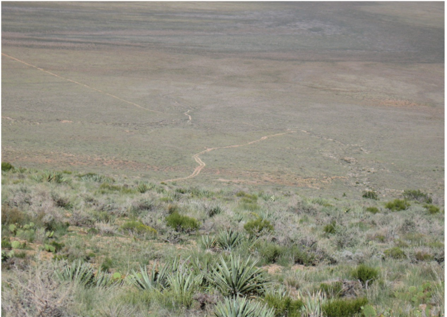
11-10 Long Descent to House Rock