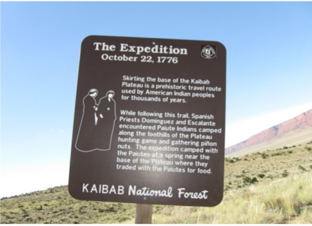
11-9 Historical Marker