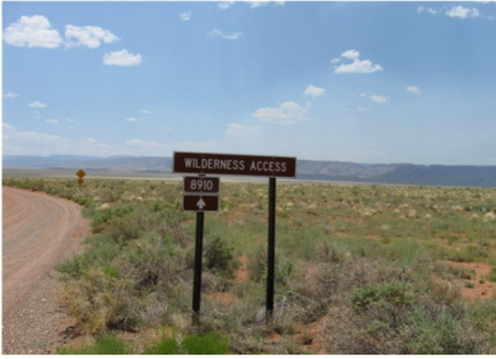
11-1 Entry to House Rock