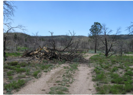
11-16 Fallen Tree Area